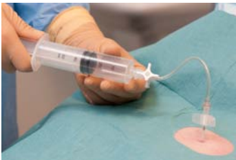
Figure 3. Aspiration of Air from a Pneumothorax.

The appearance of air bubbles in the syringe, which is partially filled with the local anesthetic, indicates that the catheter has penetrated the pleural space.