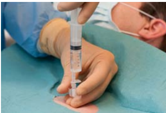
Figure 2. Confirmation of Penetration of Pleural Space.

Attach the tubing with the three-way stopcock to the catheter, and use the 50-ml or 60-ml syringe to gently aspirate the air from the pleural space (Fig. 3). Manipulation of the three-way stopcock requires close attention, since any opening to the