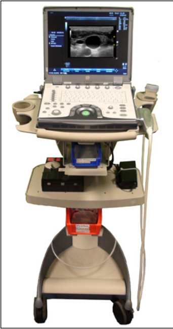
Figure 1. Ultrasound Machine with Transducer.

Ultrasound machines with linear-array, high-resolution vascular transducers are preferred for this procedure (Fig. 1). You will also need sterile transduction gel, an acoustically transparent sterile transducer sheath, and sterile rubber bands or clips to secure the sheath around the transducer.