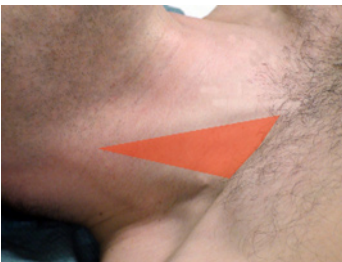
Figure 2. Triangle Delimited by the Two Heads of the Sternocleidomastoid Muscle and the Clavicle.

The two heads of the sternocleidomastoid muscle and the clavicle form a triangle at the anterior neck. The internal jugular vein may be accessed within this triangle, approximately 2 to 3 cm above the clavicle (Fig. 2).