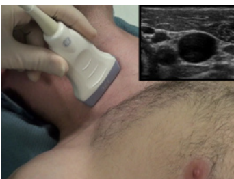
Figure 3. Ultrasound Transducer and Resulting Image.

Before starting the procedure, perform an ultrasound survey to assess the location and patency of the internal jugular vein and to evaluate the neck anatomy. Position the transducer so that the resulting image on the screen correlates with the orientation of the anatomy. Place the probe parallel and cephalad to the clavicle and along the sternocleidomastoid muscle; the common carotid artery and the internal jugular vein should be easy to identify (Fig. 3). The common carotid artery will be pulsating; it is difficult to compress. The internal jugular vein will be larger and nonpulsating and is easily compressed. Ensure that the internal jugular vein is patent by gently compressing it with the transducer — slight pressure is sufficient to collapse the lumen of the internal jugular vein. You may position the